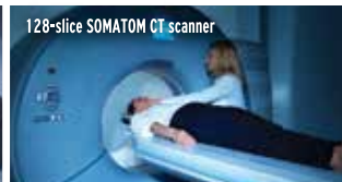
128-slice SOMATOM CT scanner

10, Asklipiou str., 570 01 Pylea Thessaloniki - Greece T +30 2310 400000 F +30 2310 471056 E info@interbalkan-hosp.gr