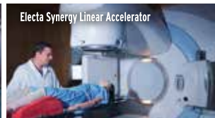
Electra Synergy Linear Accelerator