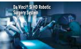
Da Vinci® Si HD Robotic Surgery System