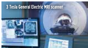
3 Tesla General Electric MRI scanner